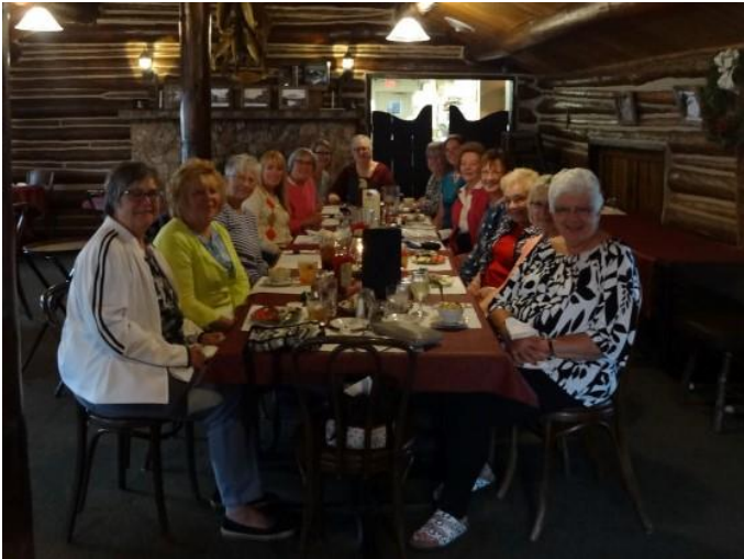
The Ladies celebrating birthdays at White Spruce Inn, Eagle River

Not only for Moon Lake gals, but friends, family and neighbors alike are invited to get together. What a great way to meet up with old friends and make new ones! Dates are scheduled whenever a group can go out, communication is via email, so if you are not on the distribution and would like to be, send an email to the editor and we'll make sure you get included.