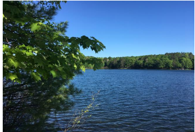
...and voila! Summer is here