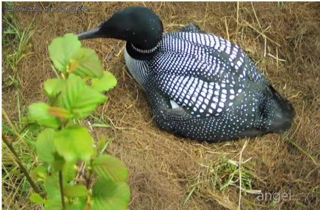
Loon Nesting on Moon Lake