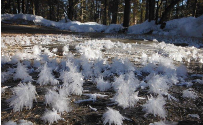
Unique ice crystal formations near Moon Lake.