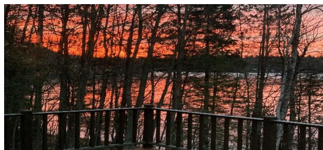
Sunrise on Moon Lake

NOTICE: Moon Lake Annual Meeting and Social will be held Saturday August 21, 2021 (Not the 14 th as previously communicated.) Location TBD. We look forward with hope to gathering again as usual. MARK YOUR CALENDARS!